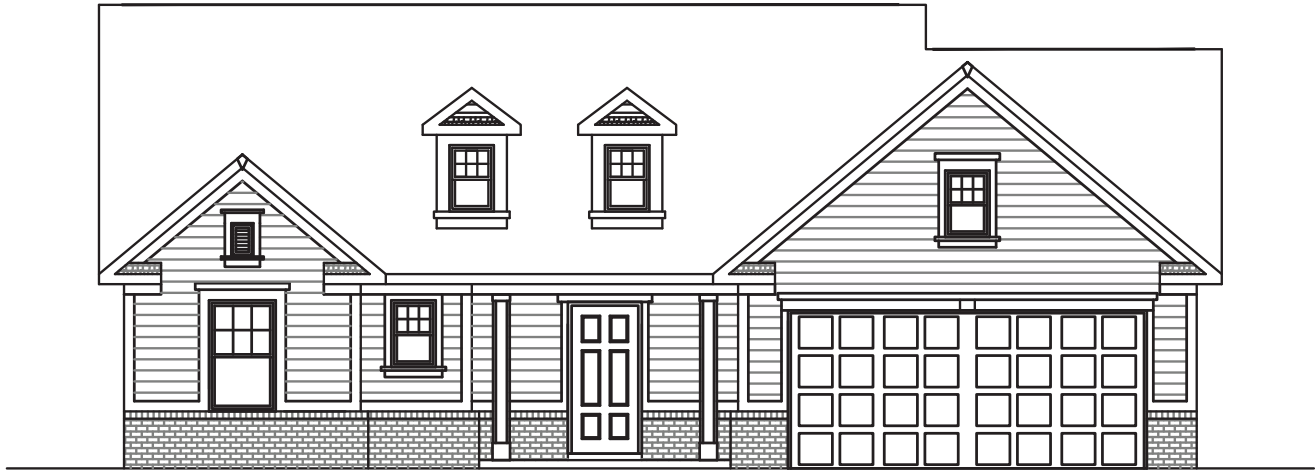
Traditional Exterior B: Full Porch *Optional Dormers Shown